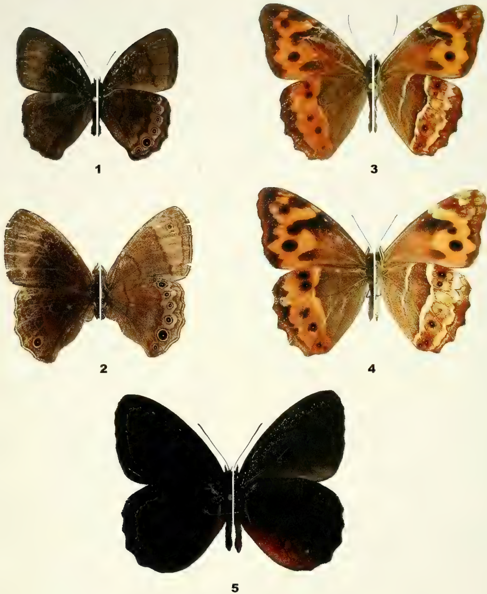
FIGS. 1–5, Some Pronophlina from the Pantepui. 1. Eretris agata , n. sp., male dorsum/venter; 2. Eretris agata , n. sp., female dorsum/venter; 3. Oxeoschistus romeo , n. sp., male dorsum/venter; 4. Oxeoschistus romeo , n. sp., female dorsum/venter; 5. Pedaliodes roraimae male dorsum/venter

without any deeper curves; a series of six submarginal rounded ocelli ringed with light orange and with small white triangular pupils, one in each cell from Rs–M1 to Cu2–1A, the biggest in Cu1–Cu2, the second biggest in Rss–M1, the remaining approximately the same size, half the size of the biggest, not touching the lines basad or distad of them, except the one in Cu2–1A, which crosses the submarginal line; a chocolate brown submarginal line, parallel to distal margin, thinner than the postmedian one; a thin dark brown marginal line parallel to outer margin.